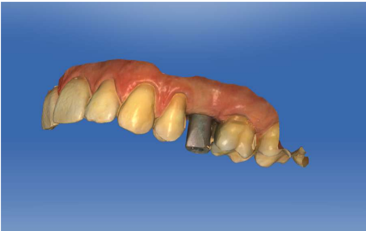
Impression with Intraoral Digital Scanner (Cerec - Sirona)