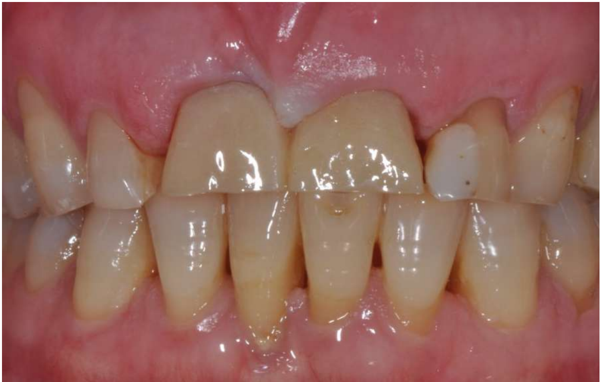
Immediately temporary screwed crowns